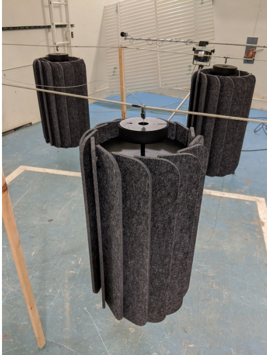
Figure 3 – Detail of specimen materials