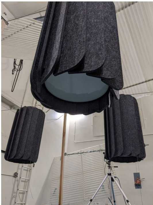
Figure 2 – Acrylic lens at underside of specimen, orientation of felt fins