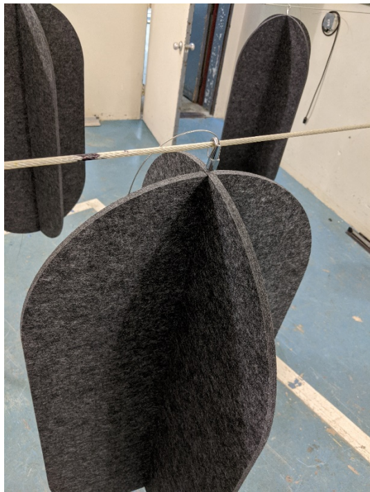
Figure 2 – Detail of specimen material