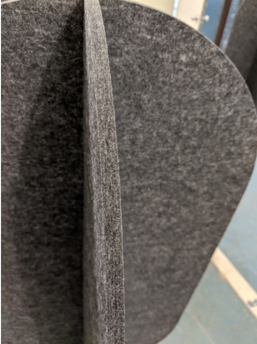
Figure 3 – Detail of specimen material